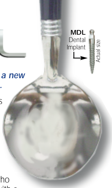
MDL Dental Implant Actual size